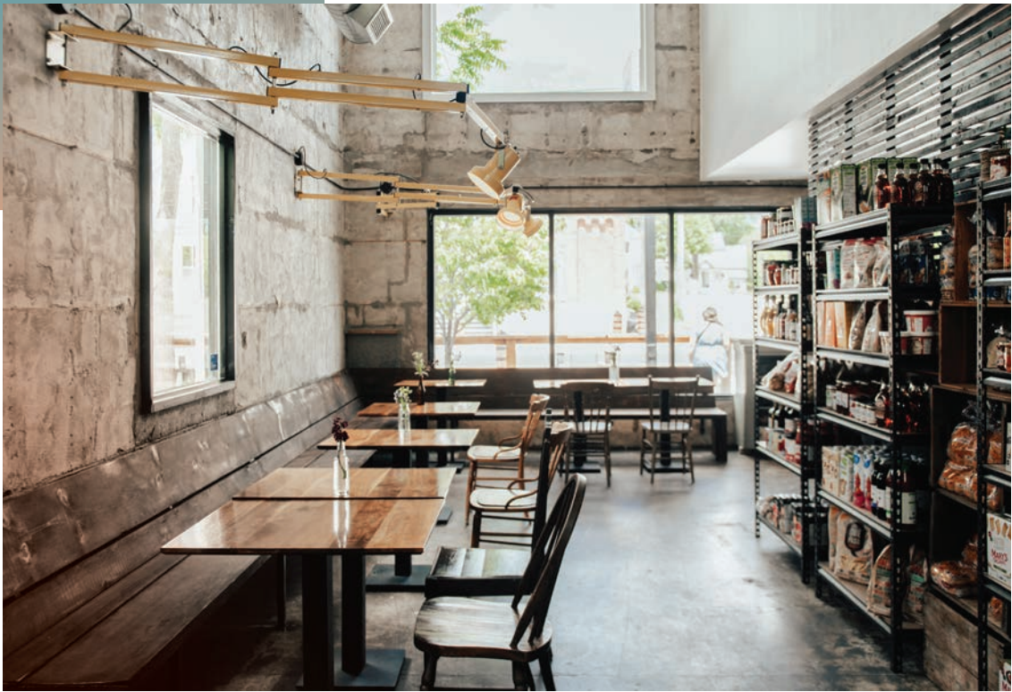
Bloomfield Public House