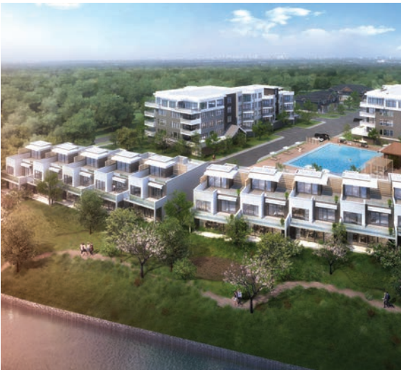
Fenelon Lakes Club

RDA gained a reputation for superior service by focusing on spaces that cater to the end user, and using design iteration tools to walk clients through the architectural process. Porta is an exciting opportunity for RDA to create an incredible and iconic waterfront community with an animated streetscape, elevated amenity spaces, and functional suite layouts, all promoting serene views of the water.