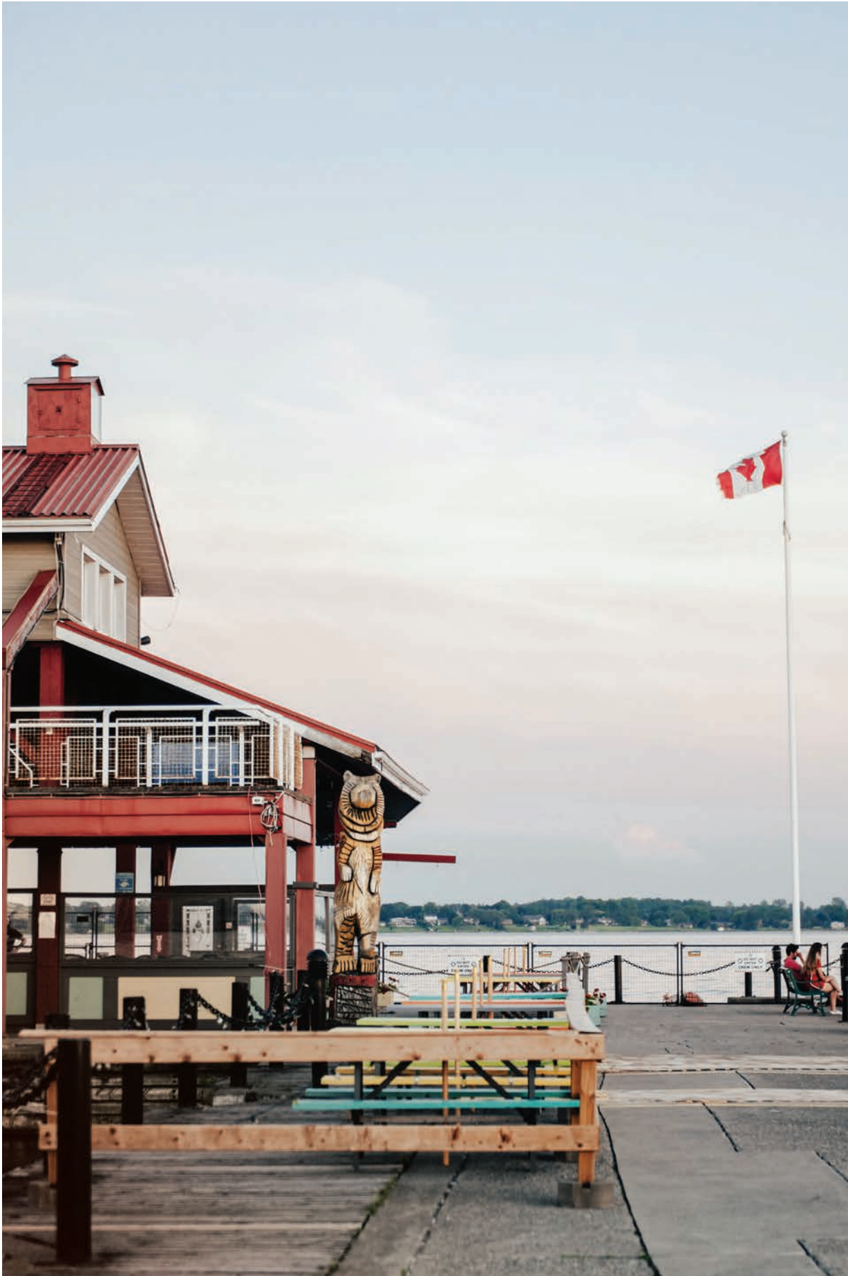
The Pier Patio Bar & Grill