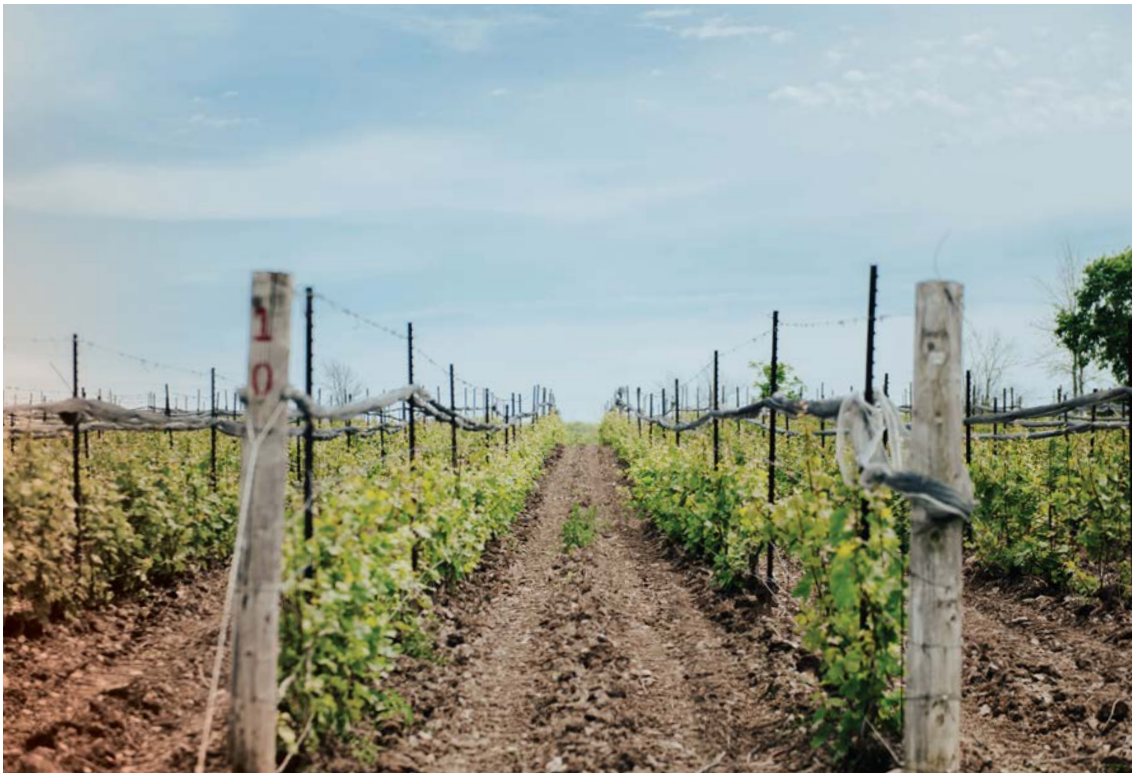
Norman Hardie Winery