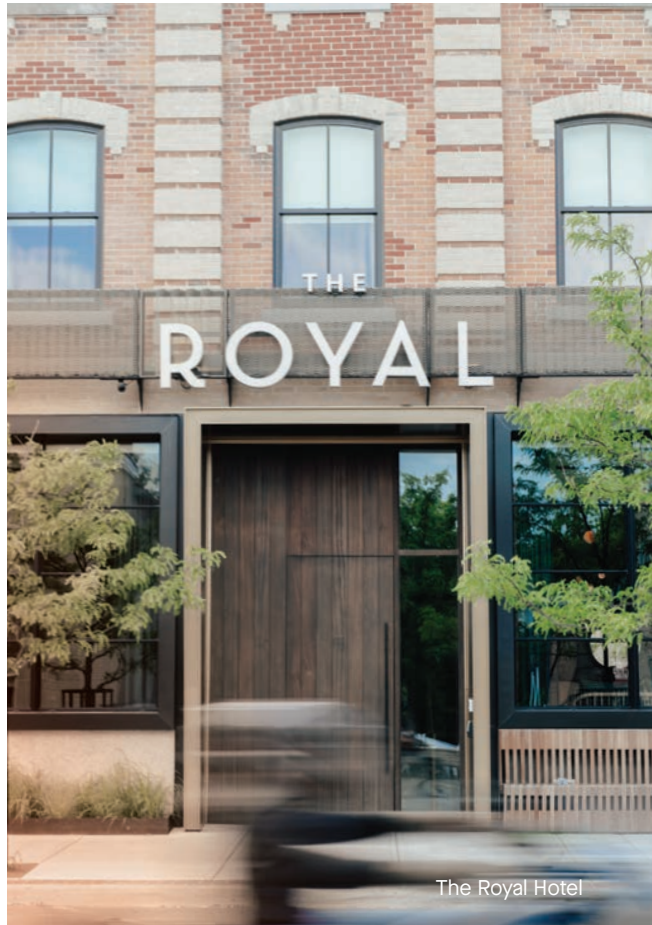
The Royal Hotel

A favourite getaway for wine-enthusiasts near and far, this premiere wine region draws in nearly 700,000 visitors every year. It's also home to a wide variety of well-loved local hotels, restaurants, artisanal markets, cafés, and shops.