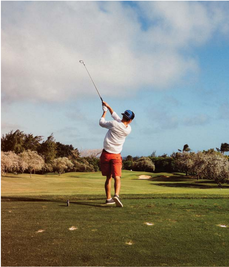
Bay of Quinte Golf & Country Club